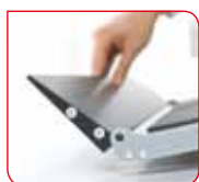
Integrated ramp folds up for troublefree transport.

After weighing, the seca 676 can be folded together in no time at all to save space. The sturdy locking device between rail and platform ensures the scale stands safely also when folded together. The rail also serves as handle when the scale is folded together, meaning that the seca 676 can be moved and stored away easily and quickly on the smooth-running transport castors.