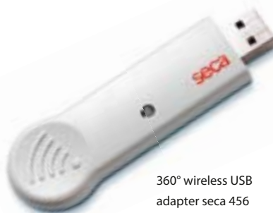
360° wireless USB adapter seca 456

With the seca software you can gain access to a centrally installed seca patient and examination database from a number of different workstations (clients). A simple user account management system permits the assignment of individual access rights.