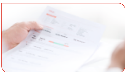
Print out the graphically formatted results for your patients – on the DIN A4 printer in your practice.

Show your patients how their measurements compare to statistical norms. Or show parents the short-term and long-term changes in the height and weight of their children. The information helps you to assess the health status and nutritional condition of your patients and enables you to provide a service that anyone in your waiting room will appreciate. Especially when he or she can take home the findings and analyses in a print-out (DIN A4). seca analytics 105 assists you with early recognition and treatment of illnesses and provides understandable graphics you can use when advising patients.