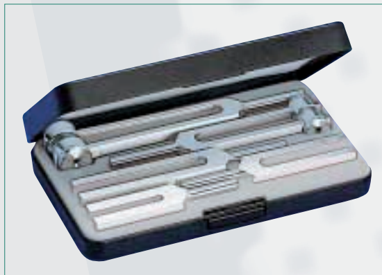
No. 5142 Set III 5 tuning forks made of aluminium (No. 5162, No. 5165, No. 5167, No. 5169, No. 5171) in plastic case