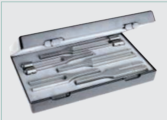
No. 5141 Set II 5 tuning forks made of steel (No. 5161, No. 5164, No. 5166, No. 5168, No. 5170) in plastic case