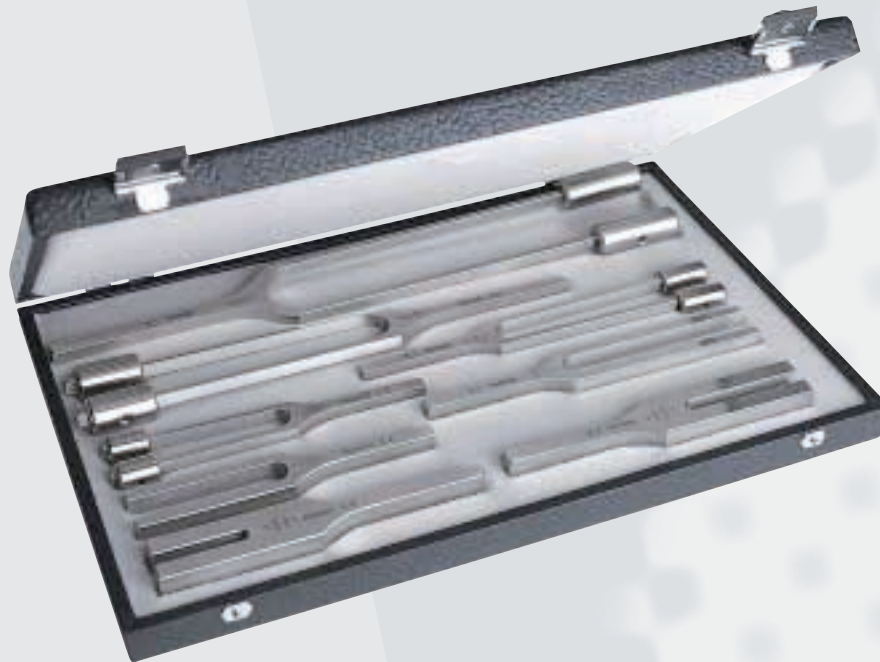
No. 5140 Set I 8 tuning forks made of steel (No. 5163, No. 5160, No. 5161, No. 5164, No. 5166, No. 5168, No. 5170, No. 5172) in wooden case

The tuning fork sets are well thought-out combinations in an attractive practical wooden or plastic case to perform full hearing tests. The most important frequencies are all conveniently to hand.