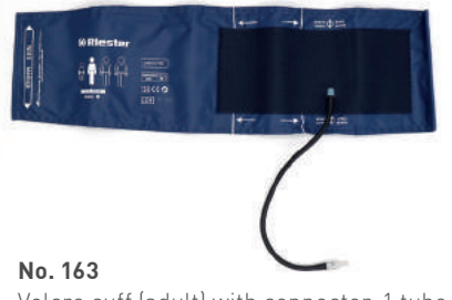
Latex-free for RBP-100 (Medium: 22 - 32 cm)