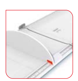
The measurement results are easy to read from the large scale.

The lightness of the measuring board is matched by the high quality of the folding mechanism, head piece and foot positioner. Special attention is paid to the choice of materials which can stand up to years of tough use without losing their shape. Additional protection is provided by the seca 412 carrier bag made of waterrepellent lightweight nylon.