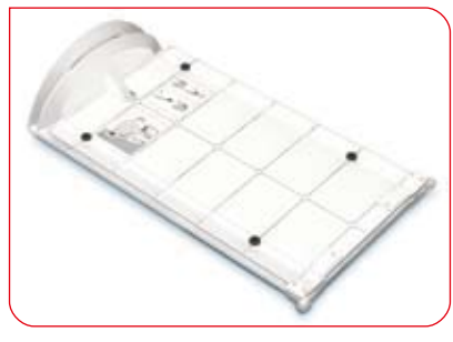
The high-quality folding mechanism guarantees a long service life.