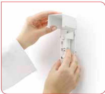
Simple refilling of up to 100 measuring tapes.

The seca 218 is available when needed. One hundred measuring tapes fit into a small wall dispenser that releases them one at a time. The dispenser can be mounted easily anywhere and refilled quickly and simply.