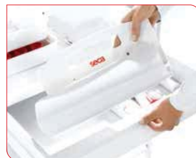
The measuring mat can be rolled up for space-saving storage.