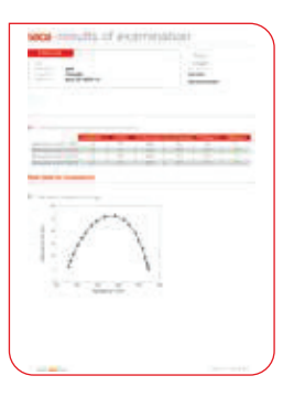
The seven modules for the analysis of measurement results can be compiled for each patient as needed and presented in an easy-to-read PDF document.