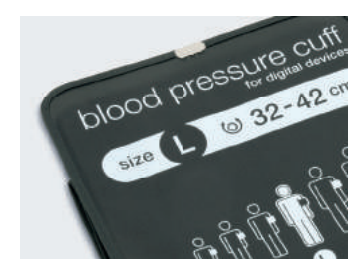
Durable BP cuffs enhanced with metal plate and cuff stitching around the exterior