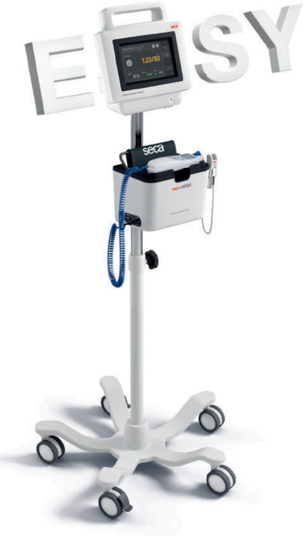
Optional mobile stand seca 475