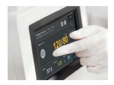
All measurements at a glance on the easy to operate 7" touchscreen monitor.