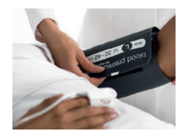
The patient's pulse rate is always measured simultaneously while using blood pressure measurement or pulse oximeter.