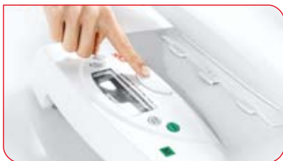
The weighing tray can be removed quickly and easily at the touch of a button.

In no time at all, the baby scale can be converted into a floor scale: pressing a button unfastens the mechanism attaching the tray to the base. When locked, this secure attachment ensures that the baby scale is easy to lift and safe to transport.