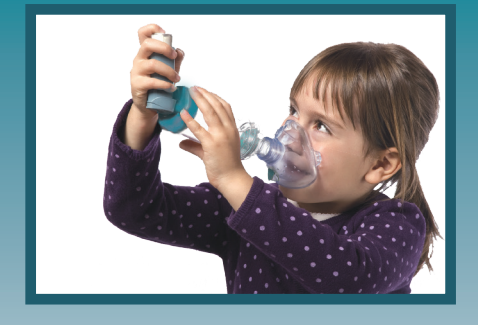
Breathe Eazy Spacer with Child Mask, separate Child Mask