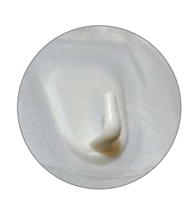
Solution bag hook enables easy bag changing without having to remove the Infu-Surg from the IV pole; keeps fluid bag in proper position while in use