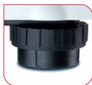
Leveling base on the bottom of the scale base for safe and secure placement.