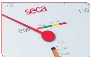
It is easy to determine BMI with the color-coded dial.