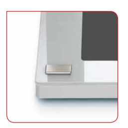
Four load cells made from brushed stainless steel.