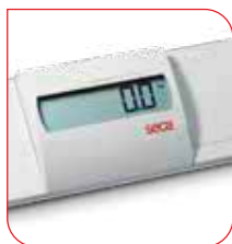
The patient's BMI can be determined when their height is entered.

The low platform profile reduces patient effort and risk when stepping on the scale. As the 22 x 22 inch platform is almost twice as large as that of a normal scale, a chair may also be placed on the scale for weighing a patient. With the pre-TARE function, the weight of a chair or standing aid can simply be tared away. Up to 3 TARE weights (e.g. chair weights) can be stored.