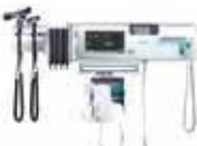
Welch Allyn Connex® Integrated Wall System