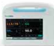
Welch Allyn Connex® Vital Signs Monitor