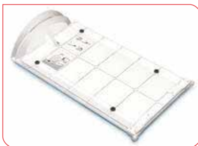
The high-quality folding mechanism guarantees a long service life.