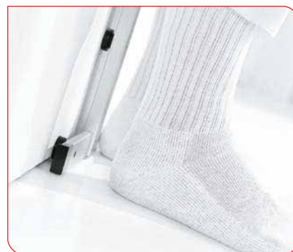
The foot positioner ensures exact positioning and precise measurements.

The telescoping function ensures that readings are always at eye level, for accurate readings regardless of the angle from which one looks. The seca 222 comes with an attachable headpiece for accurate head adjustment. When not in use, the measuring slide can be folded down for safety.