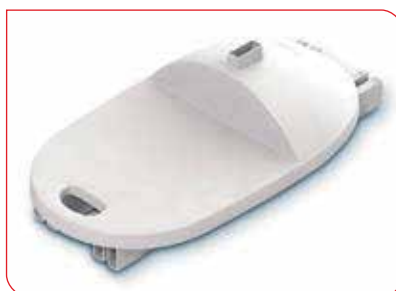
Integrated handle and secure catches on all individual parts for transport ease.