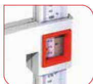
Two large windows and double-sided scale for easy readout.