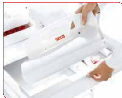
The measuring mat can be rolled up for space-saving storage.