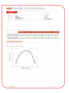
The seven modules for the analysis of measurement results can be compiled for each patient as needed and presented in an easy-to-read PDF document.