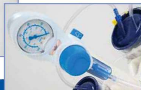
Cascade Stand detail

BactiClear® Range (see reverse for specifications)