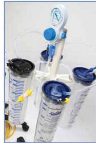
Cascade Stand detail

BactiClear® Antimicrobial Disposable Suction Range from VacSax® the product of choice