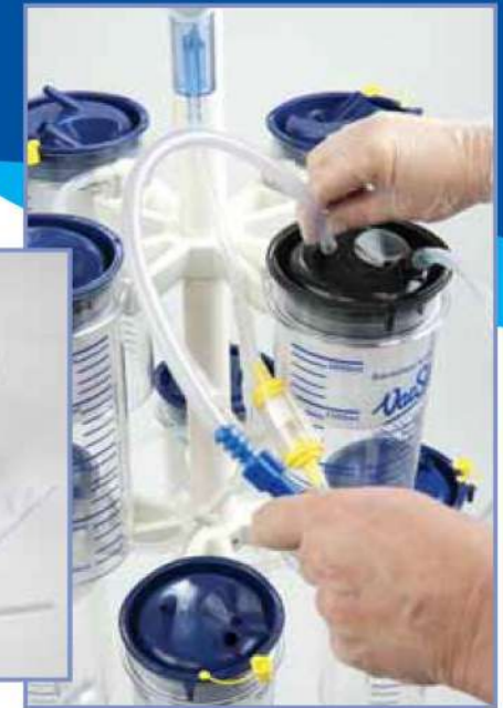
1, 2 & 3 Litre Liners and Canisters.