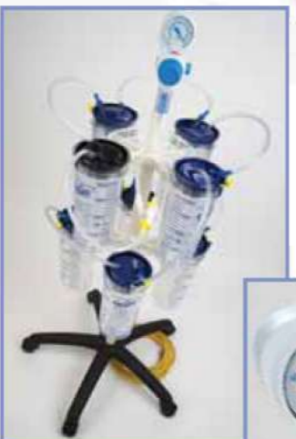
8V 2 Litre Cascade Stand set up